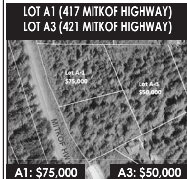
A1: $75,000 A3: $50,000

A1: The perfect canvas for your dream home a short 4 miles from downtown. 1.03-acre parcel of vacant land zoned rural residential provides ample space for everything you've ever envisioned—sprawling family residence, cozy retirement retreat, or a charming starter home. Enjoy the convenience of water, sewer, and electric services available adjacent to the property at the highway.